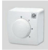
3 speed selector included Dimensions LxWxH (mm): 80x80x70.